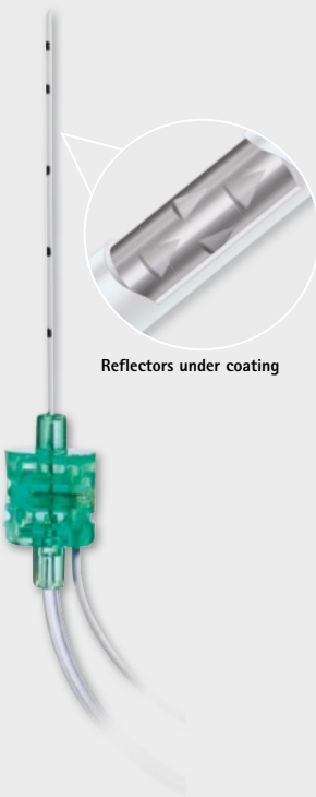
Reflectors under coating