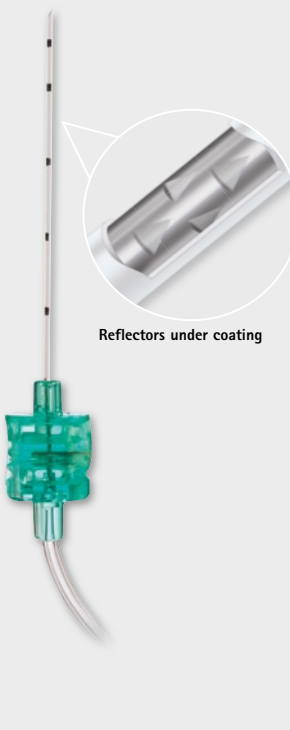
Reflectors under coating