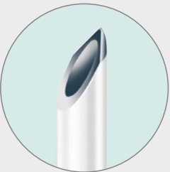
Ultraplex® 30° bevel